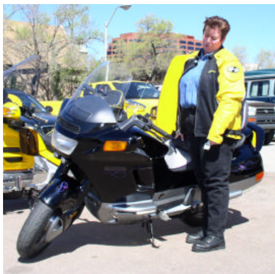
Saying goodbye to an old friend.