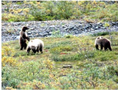
Momma Grizzly and her two kids in Denali Nat'l Park

Apex Sports is one of Colorado's leading motorcycle dealerships, offering a premium selection of new and used motorcycles, ATV's, custom trikes, and trailers. We provide a wide variety of high quality parts and accessories. Additionally, we have a fully certified service department to meet all your needs.