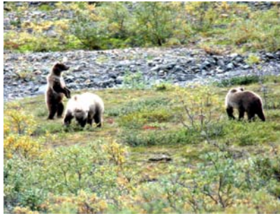
Momma Grizzly and her two kids in Denali Nat'l Park

Apex Sports is one of Colorado's leading motorcycle dealerships, offering a premium selection of new and used motorcycles, ATV's, custom trikes, and trailers. We provide a wide variety of high quality parts and accessories. Additionally, we have a fully certified service department to meet all your needs.