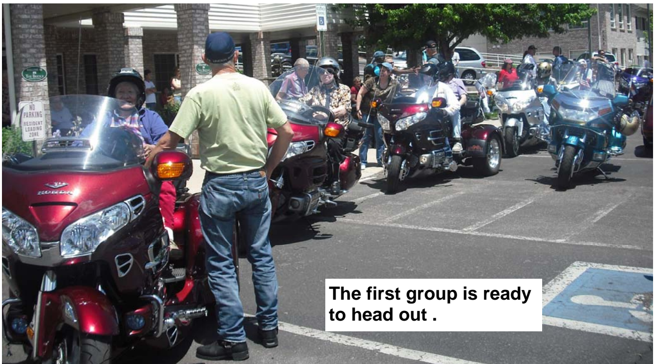
The first group is ready to head out .