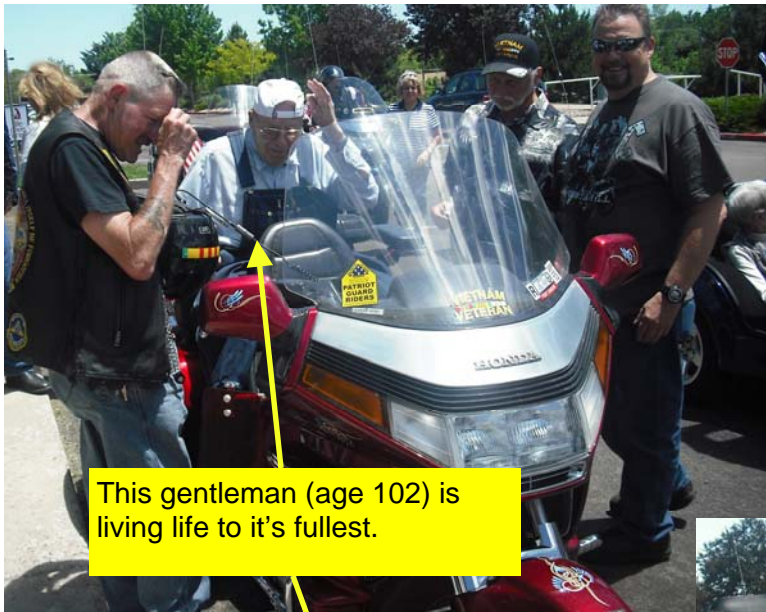
This gentleman (age 102) is living life to it's fullest.