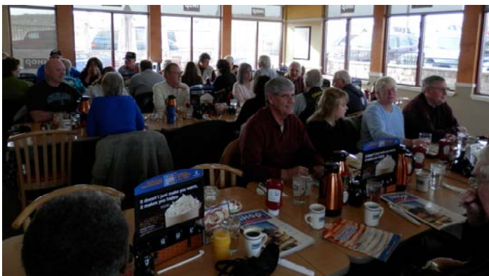
NEW YEAR'S DAY BREAKFAST GATHERING