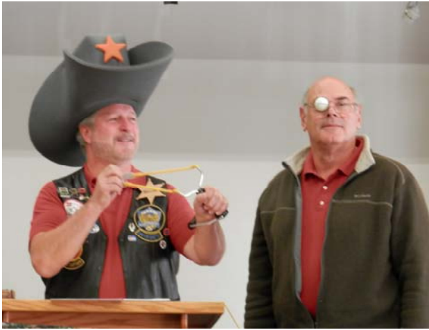
SHARP SHOOTER SHERIFF — Woops!