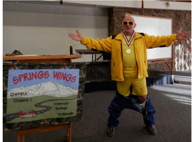
YELLOW THRU & THRU !