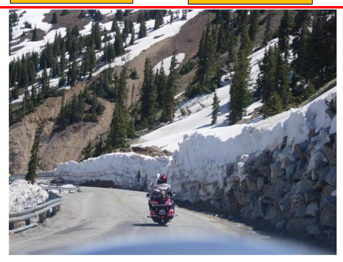
WHERE'S THE WING ??

Do you know where the Wing in this photo is? [Event / town / location]