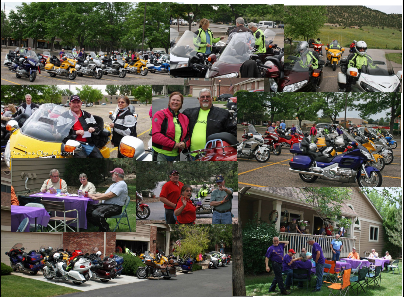
Chapter G Pig Roast Pictures