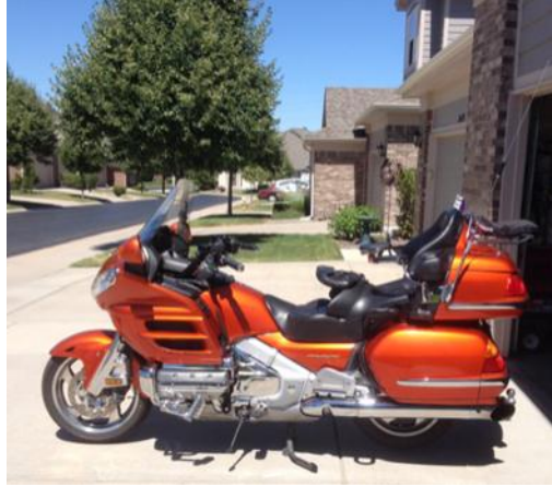
2003 Honda Goldwing GL1800

Excellent Condition -- Completely overhauled and ready for any trip - 95000 miles