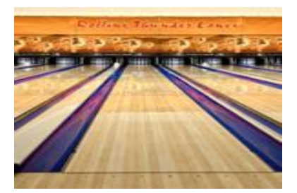
Bowling and Mini Golf

The GWRRA room rate of $120 (Plus 3% Tribal Tax) includes all Resort fees. Make your reservation today, ROOMS WILL SELL OUT . For reservations call 970-563-7777 ask for the Front Desk / Reservations. From there give the August 16, 17 & 18 dates and ask for the "GWRRA" room block to get the discounted room rate. Early check in and late check outs are available. Standard check in is 3pm and check out is 11am.