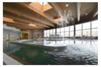
Indoor Pool and Spa

<u>GWRRA FOUR CORNERS</u> <u>MULTI-DISTRICT</u> <u>RALLY</u>