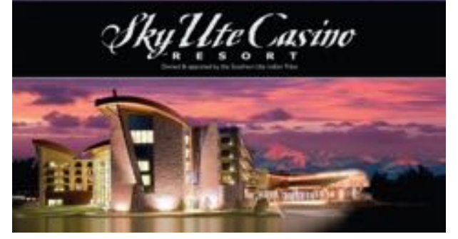
August 16,17,18 at the Beautiful Sky Ute Casino Resort 14324 Hwy 172 Ignacio, Colorado