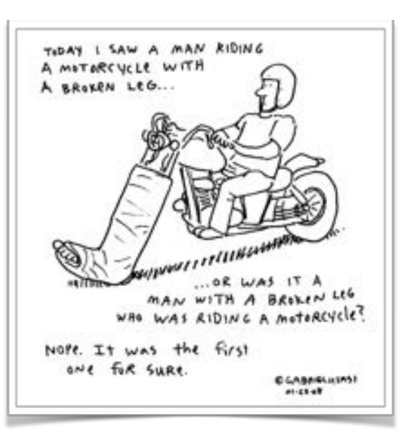
Page # 14