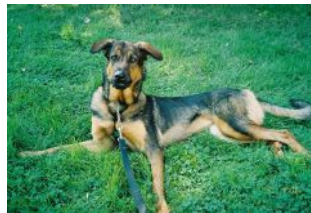
Molly-Dharma ... Pawing It Forward Since 2007

Let's help make this a great annual event for a new shelter every year. With your help, we can!