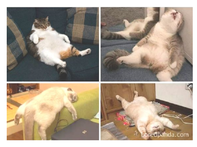
Don't be a sofa cat... the Chapter needs your help