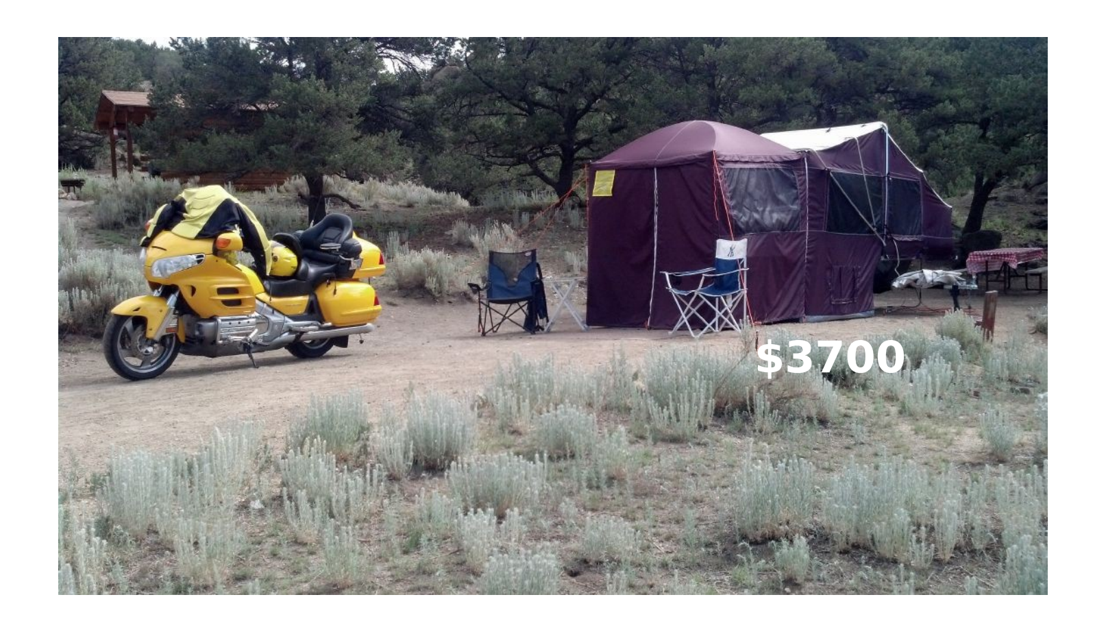
2014 B&F Specialties Bunkhouse LX, now made by Bushtec

Included are the walls to enclose the foyer, and a wide overhang on the side, they call it the Garage. AC duct for a small portable unit. Will also come with several custom items we built/adapted just for this camper.